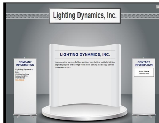
LIGHTING DYNAMICS 2015 Bronze Sponsor